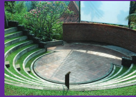
OPEN AIR THEATER