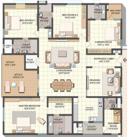
3380 Sft, 4 BHK + SQ EAST FACING