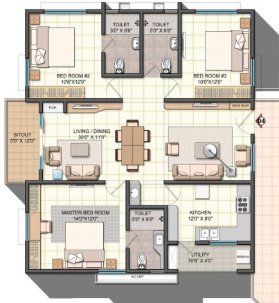
1535 Sft, 3 BHK EAST FACING