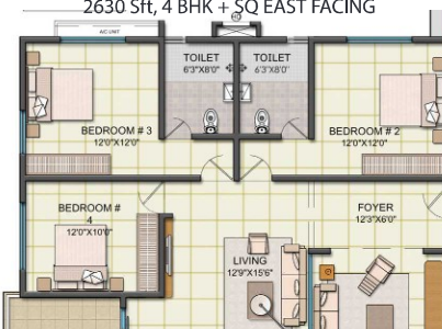
2630 Sft, 4 BHK + SQ EAST FACING