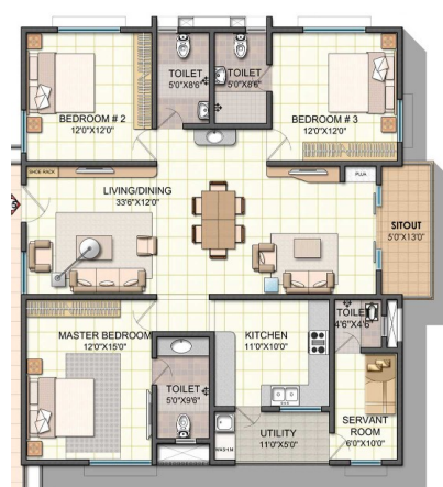
1875 Sft, 3 BHK + SQ, WEST FACING