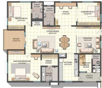
2540 Sft, 3 BHK + STUDY + SQ, EAST FACING