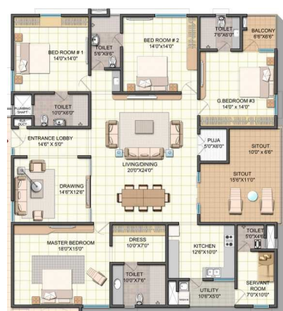
3380 Sft, 4 BHK + SQ WEST FACING