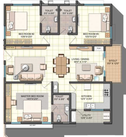
1535 Sft, 3 BHK WEST FACING